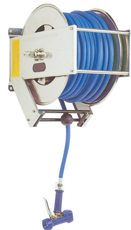
UMU ID40 B2HSB